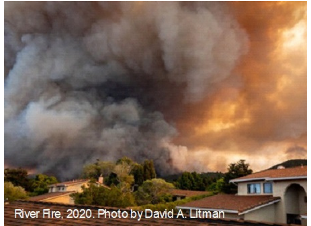
River Fire, 2020.